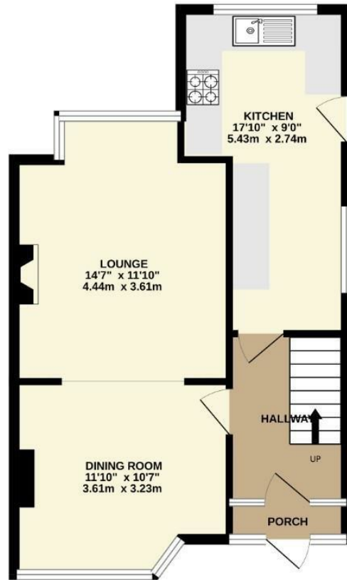
GROUND FLOOR 483 sq.ft. (44.9 sq.m.) approx.